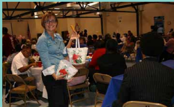
Locally grown apples are distributed at a Rochester City school event focused on healthy eating options.