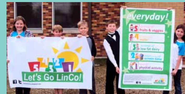
Students from the Davenport Elementary School District celebrate the kick-off of the "Let's Go LinCo!" campaign, a unified message shared in multiple settings throughout the community.