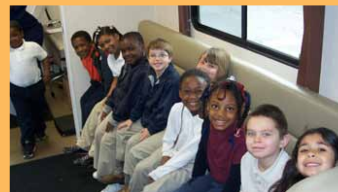
Children wait to be seen in ARcare's mobile unit, excited to discuss their healthy weight and to create a healthy weight plan.

The Woodruff County, Arkansas team decided that rather than encourage, instruct, and/or plead with families to bring their children to the local clinic for a BMI check, they would bring the clinic to the children to inspire individual action. Using a mobile health unit, providers from ARcare, a federally-qualified community health center that serves the area, spend time at local schools talking to the kids about healthy habits and measuring their vital statistics inside the traveling clinic. Kids are enthusiastic about this novel approach to healthcare, and comprehensive data was captured and shared with families. What's more, since ARcare now includes BMI measurements and healthy weight plans in its electronic medical record system, the data is permanently part of each patient's record, giving the patient, parents, and all of his or her providers important information and tools for monitoring and making progress.