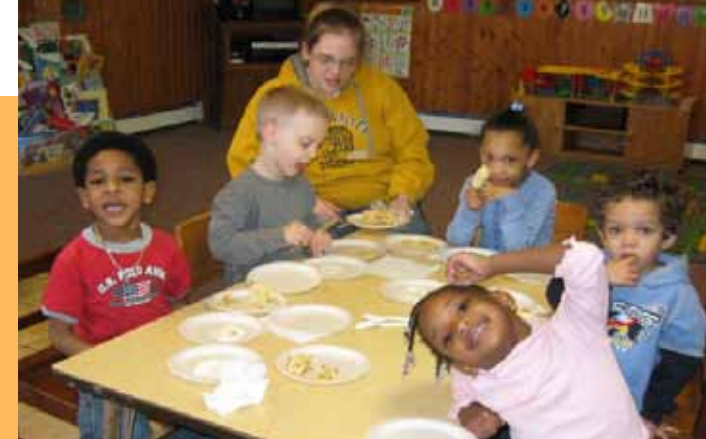
Children at an early childcare center in Rochester, NY, are provided training on obesity prevention.

The Boston, Massachusetts team is training both parents and educators in six early childhood centers about adopting healthy lifestyle choices. Staff, including teachers, program directors, and even food service cooks, participated in the training, learning how to foster healthy habit development in young children, and find fun