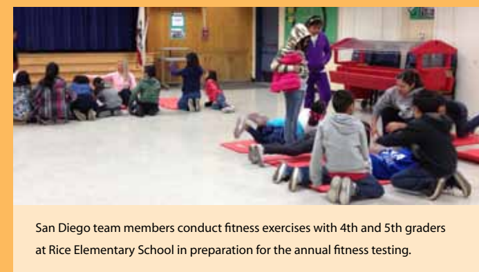
San Diego team members conduct fitness exercises with 4th and 5th graders at Rice Elementary School in preparation for the annual fitness testing.

The team has worked with Rice Elementary School to measure students’ BMI, and has supported special family events at the school such as cooking demonstrations with healthy recipes and Zumba classes, a popular Latin-inspired dance-fitness program. They have also worked effectively with the school district to overhaul the wellness policy, instituting a new “no-food celebration” rule, so that birthdays and other special occasions are celebrated with games and/or small prizes such as pencils or stickers rather than typical sweet treats. New fundraising guidelines have eliminated the sale of cookie dough and candy to raise money. The team has also helped the schools create better access to gardening and physical activities. In the child care center, they helped sponsor a successful health fair.