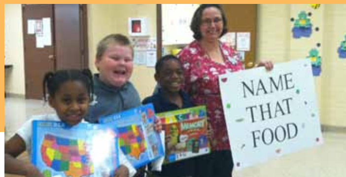
Students at the Augusta Elementary School participate in a “Name That Food” game to help them differentiate between certain fruits and vegetables.