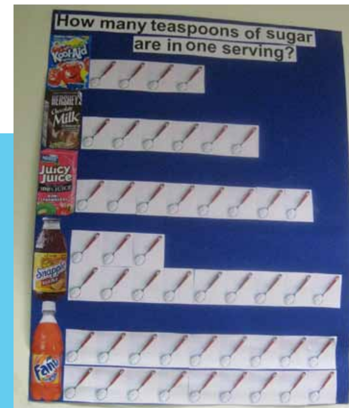
A display in a Rochester, NY, practice demonstrates the amount of sugar contained in popular beverages.